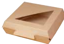
Personal pan pizza NFN-F663RQVTWF