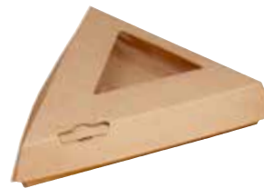
16" pizza - 6 cut NFN-F808RQVTWF