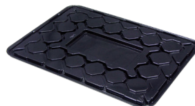
Sheet and Bar