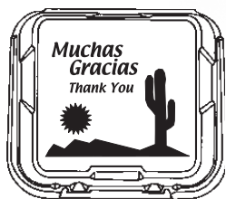
Muchas Gracias - Thank You Embossed