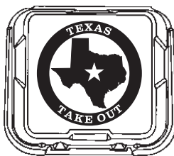
Texas Take Out Embossed