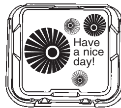
Have a Nice Day! Debossed