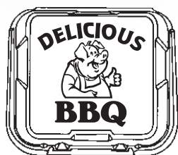
Delicious BBQ Embossed