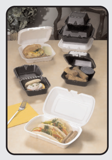
Genpak's Sandwich and Snack Containers are perfect for carryout and "doggy bag" applications and will accommodate anything from wings to subs and everything in between.