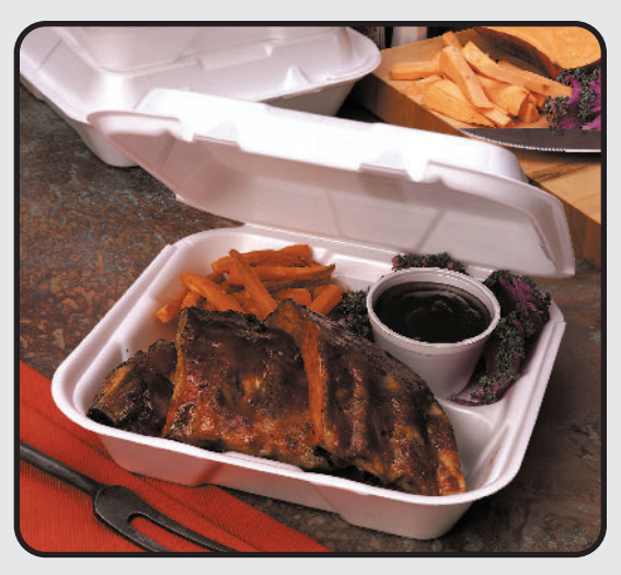
Genpak's Dinner Containers offer one, two or three compartments for proper food storage and separation for your "To Go" full size meals.